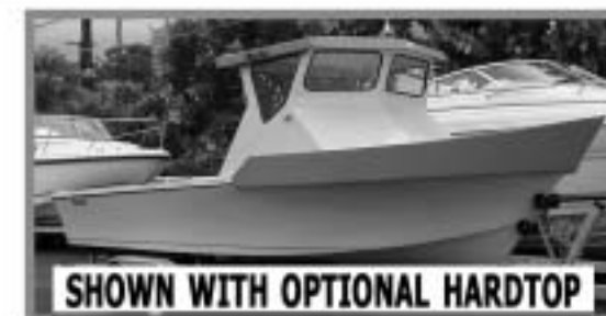
SHOWN WITH OPTIONAL HARDTOP

WORK BOATS, FISHING BOATS AND DIVE BOATS BUILT IN HAWAII TO SURVIVE SOUTH PACIFIC WATERS