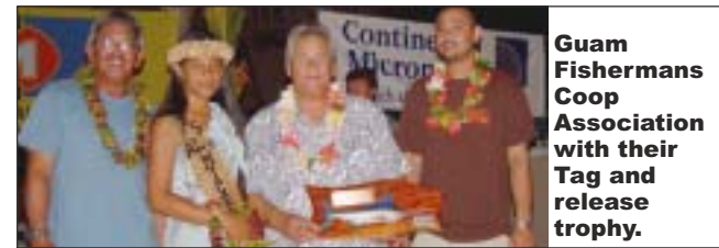
Guam Fishermans Coop Association with their Tag and release trophy.