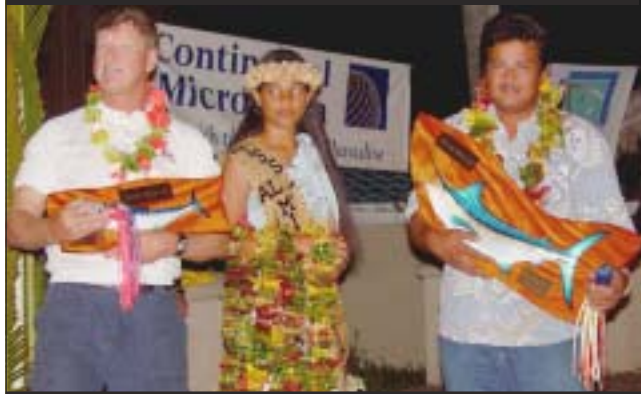
2ND PLACE BILLFISH & 3RD PLACE WAHOO: These fish were good enough to win these guys 3 FREE nights accommodation at Marshall Islands Resort.