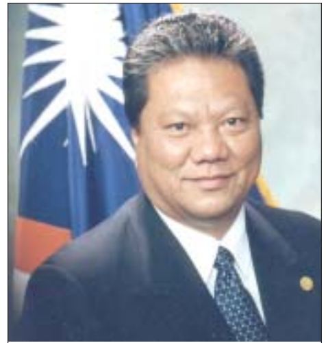
Kessai H. Note President